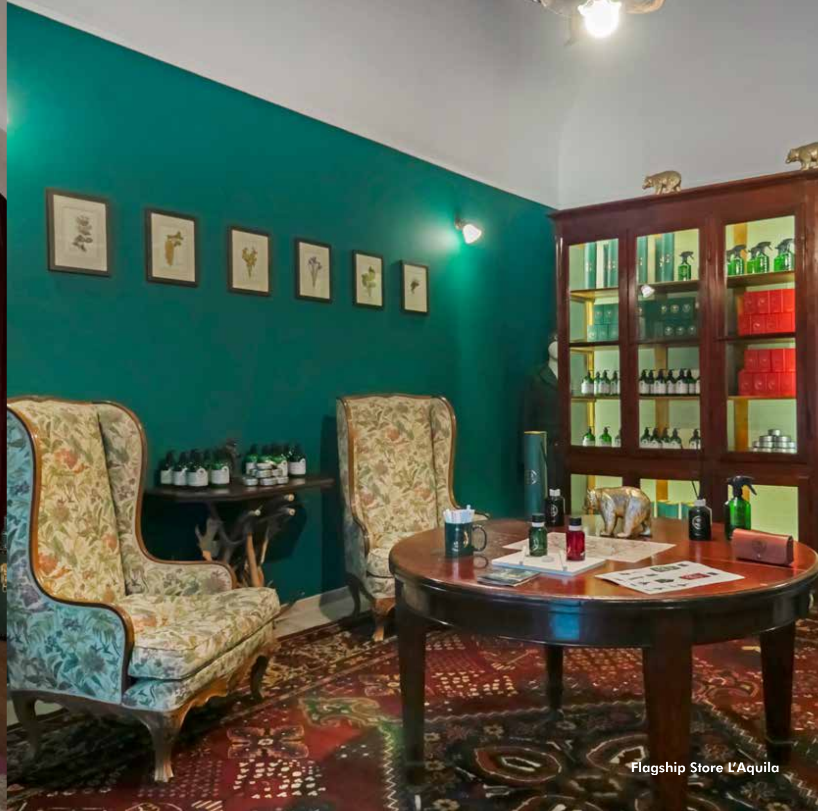
Flagship Store L'Aquila