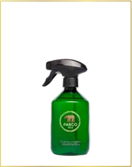
HOME FRAGRANCE SPRAY 500 ml