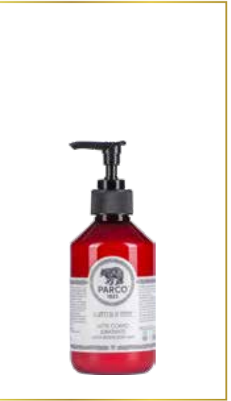
MOISTURIZING BODY MILK 300 ml