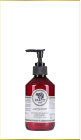
PURIFYING BODY WASH 300 ml