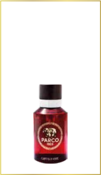
EAU DE PARFUM 100 ml