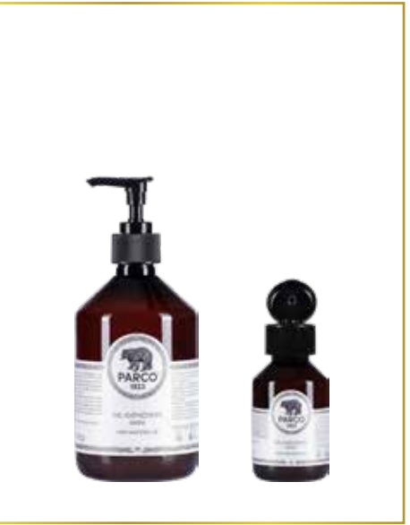
HAND SANITIZING GEL 500 ml / 100 ml