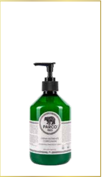
NOURISHING HAND/BODY CREAM 500 ml