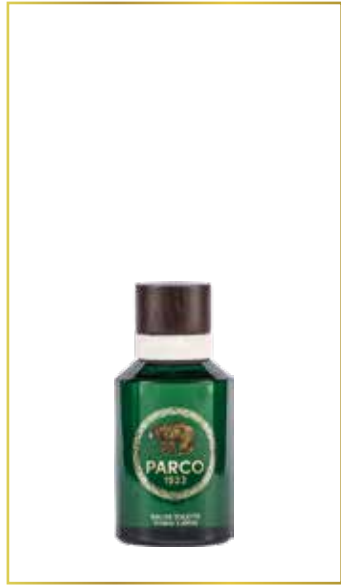
EAU DE TOILETTE 100 ml