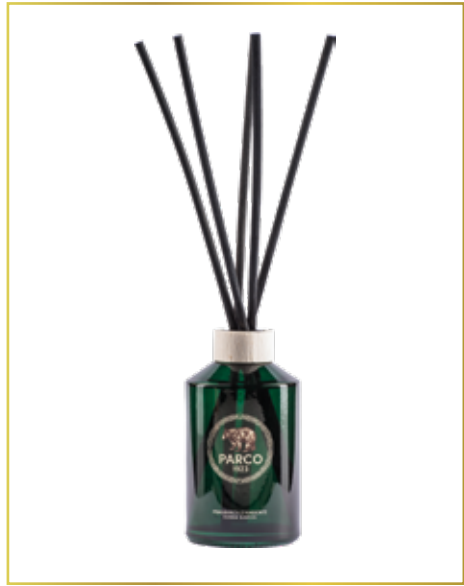
AMBIENT PERFUME 250 ml