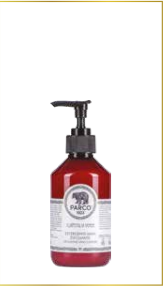
EXFOLIATING HAND CLEANSER 300 ml