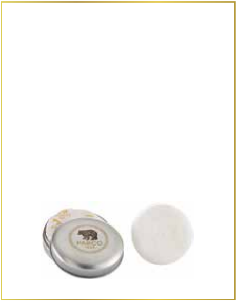
SOAP 80 GR