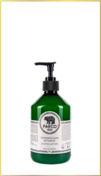
EXFOLIATING HAND WASH 500 ml