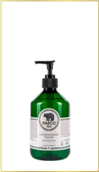
GENTLE BODY WASH 500 ml