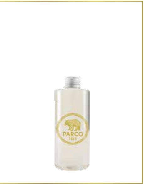
RECHARGE AMBIENT PERFUME 250 ml