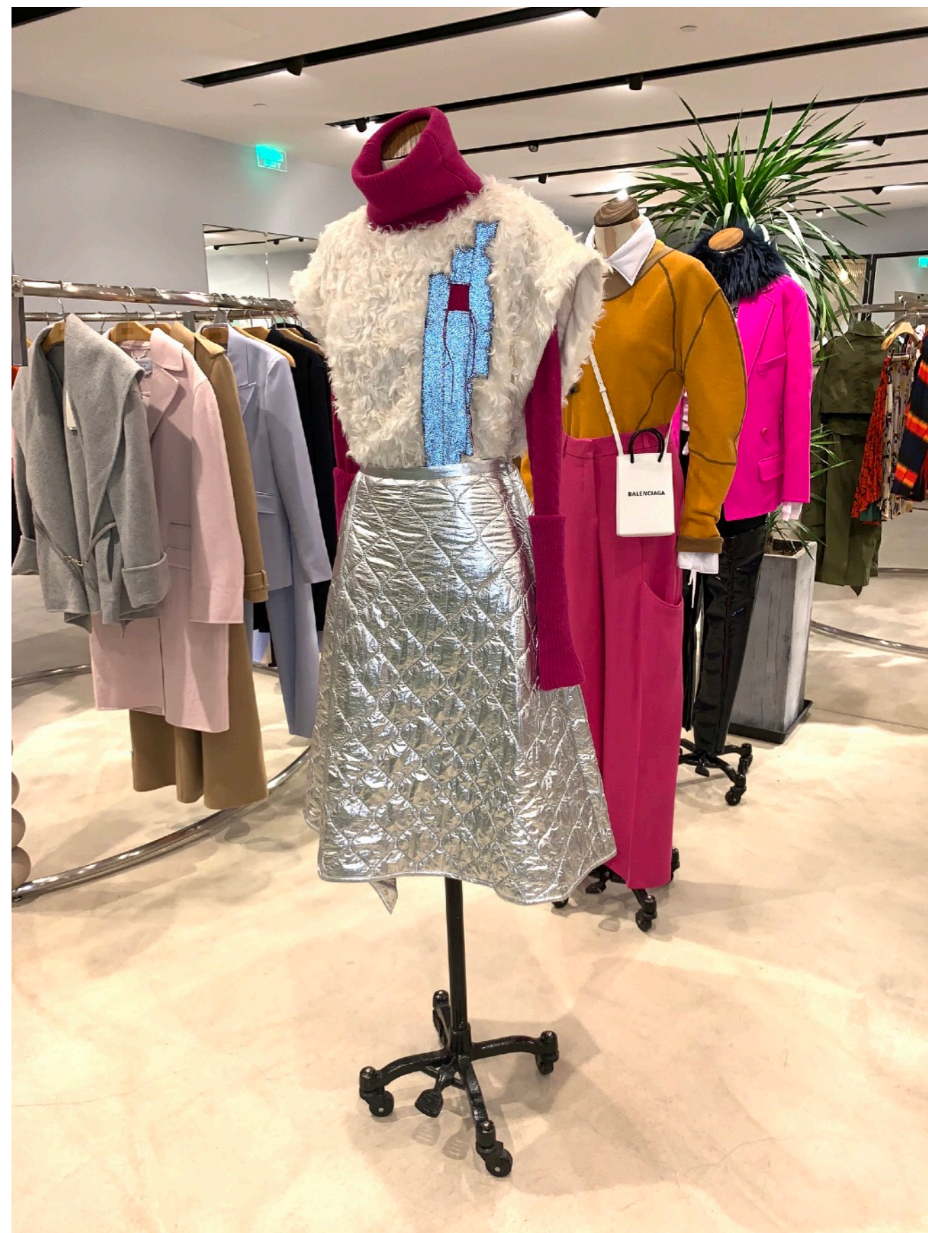
exclusive at JOYCE Shanghai