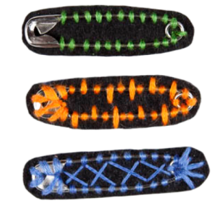
SAFETY PINS Brooches Embroidery Green - Orange - Blue