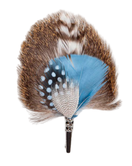
DROP Brooch Feathers Beige & Blue