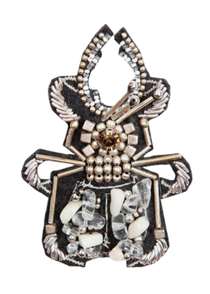
BEETLE Brooch Embroidery Silver