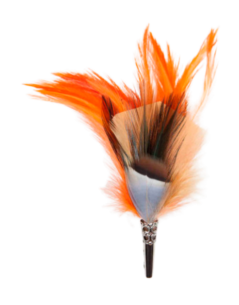
LOOSE Brooch Feathers Orange & Dark Green