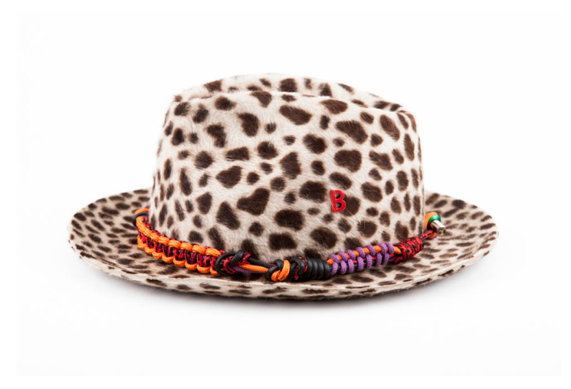
FEDORA Rabbit Fur Felt Leopard With CELTIC KNOTS