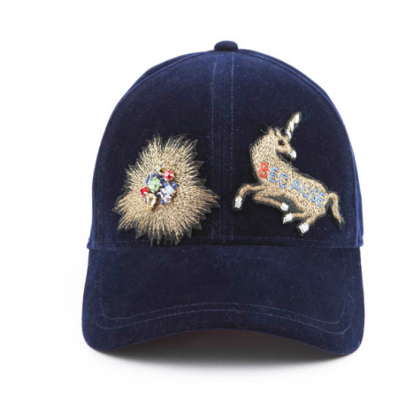
BASEBALL CAP Velvet Midnight Blue with UNICORN & LIKE THE SUN