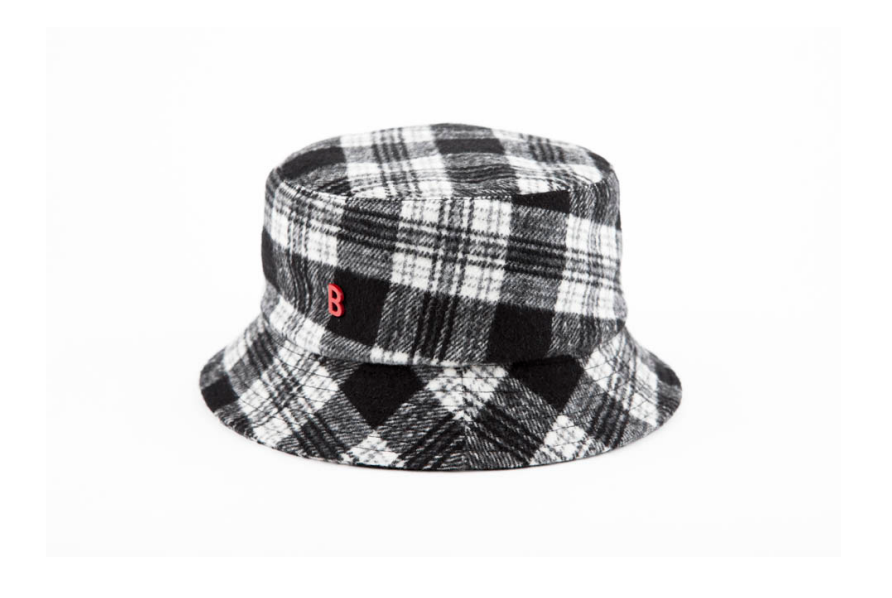
BOB Tartan Fabric Black & White