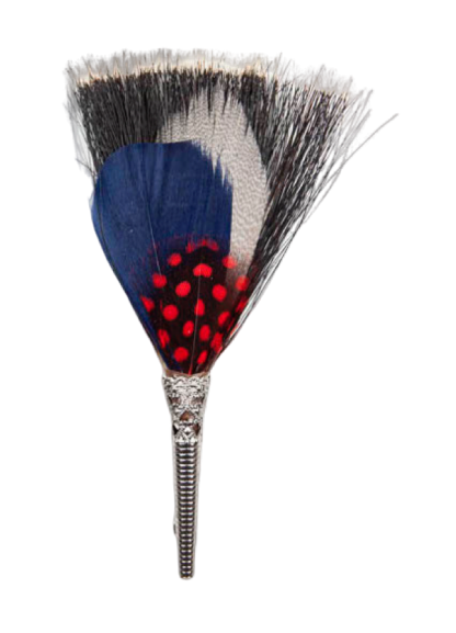
BRUSH Brooch Feathers Red & Blue