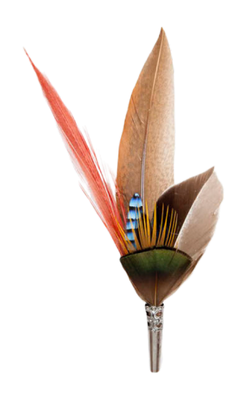
PENCIL Brooch Feathers Brown & Red