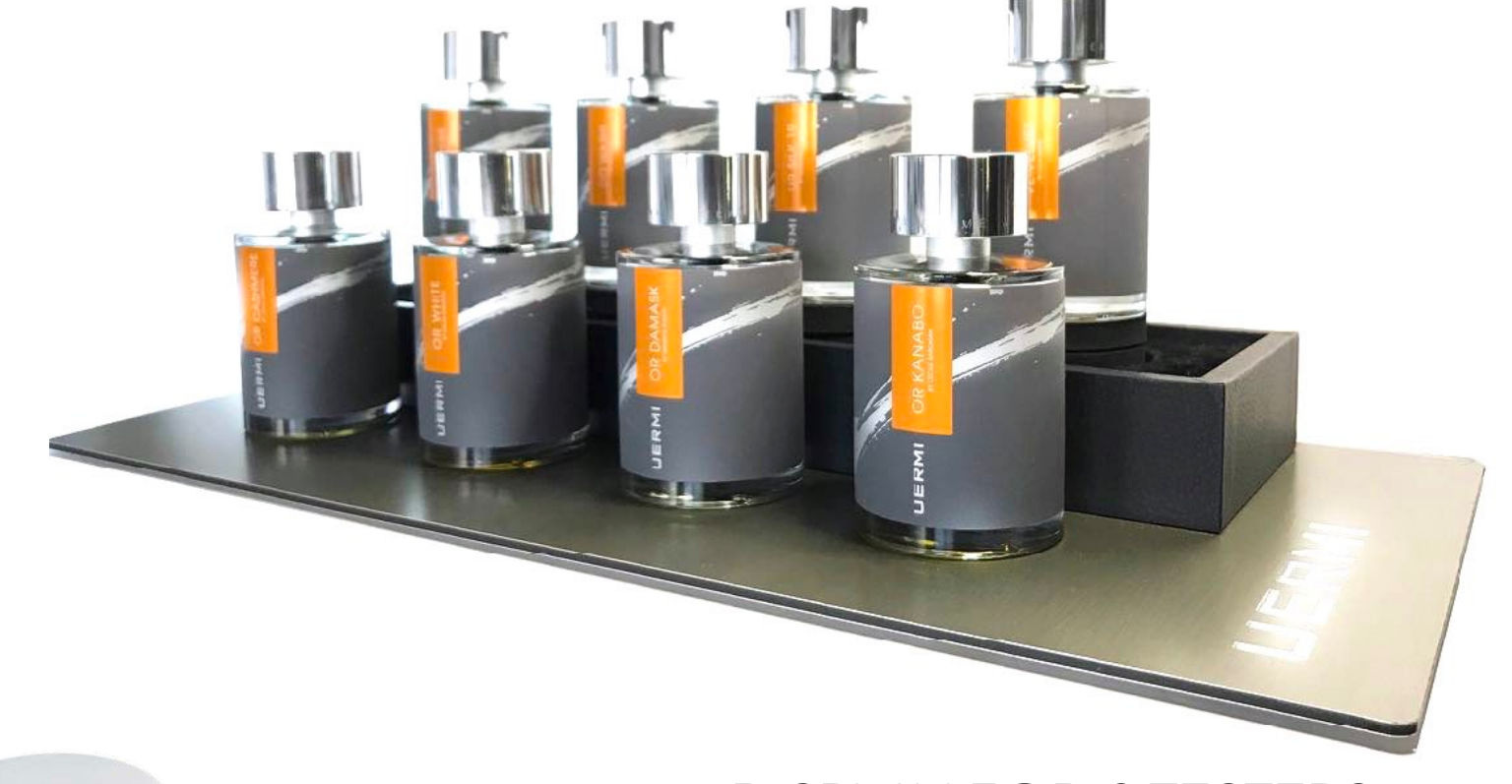
DISPLAY FOR 8 TESTERS WITHOUT CYLINDERS

*each cylinder contains a special material already sprayed with its fragrance to be periodically revived with a few puffs to maintain the scent