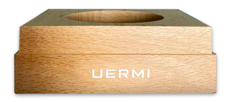
BEECHWOOD DISPLAY for single 100ml UE709 - 10x8,5 cm