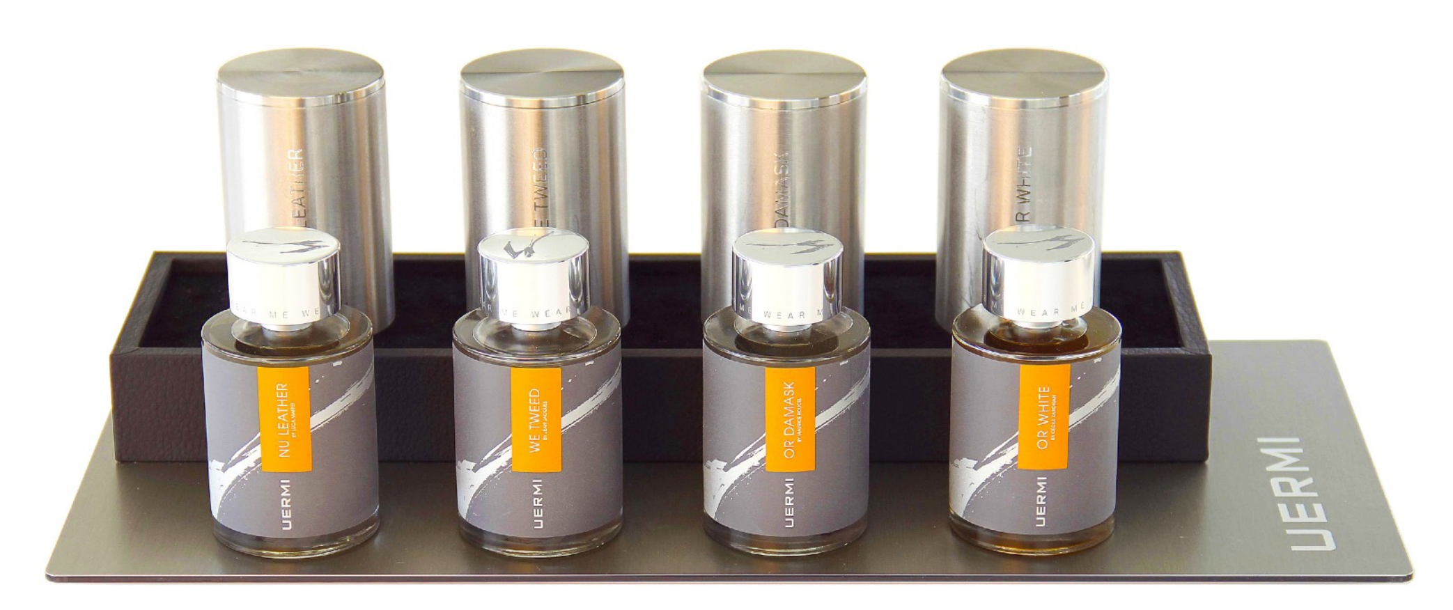
DISPLAY FOR 4 TESTERS WITH CYLINDERS*

A UNIQUE WAY TO SMELL THE FRAGRANCE IN OUR EXCLUSIVE STAINLESS STEEL SCENTED CYLINDERS*