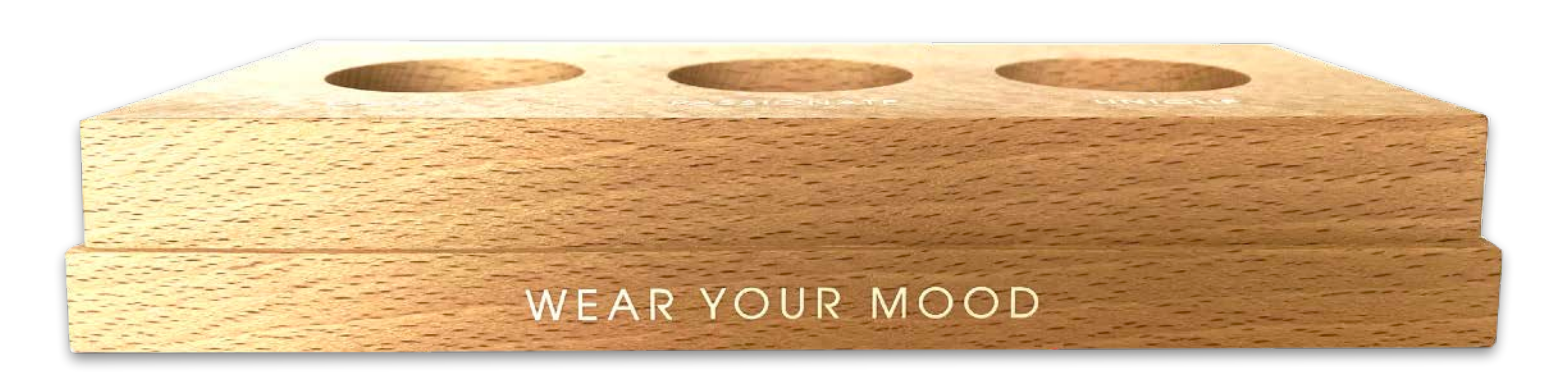
BEECHWOOD DISPLAY for 3X30ml UE707 - 19x9 cm