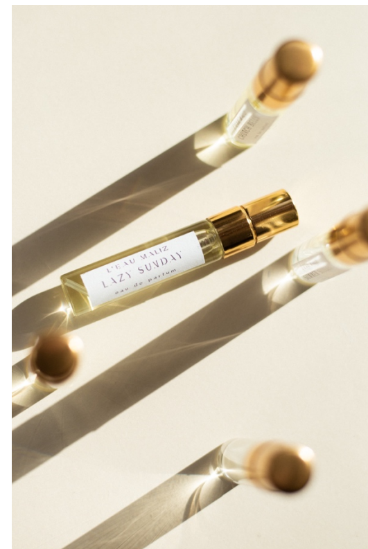
TRAVEL SIZE (5 ml)