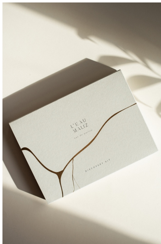
DISCOVERY KIT (5 * 5 ml)